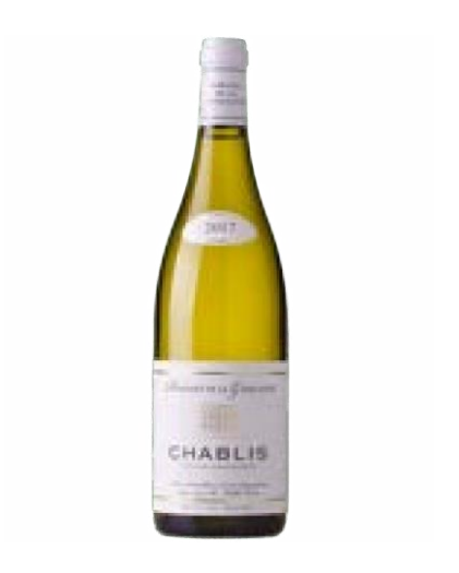
27 Chablis, Domaine de la Genillotte