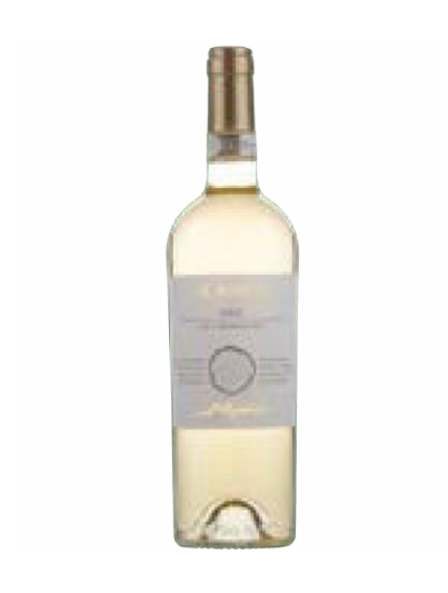
Gavi DOCG, Il Rocchin