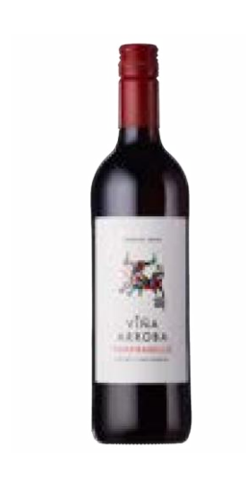
09 Tempranillo, Vina Arroba