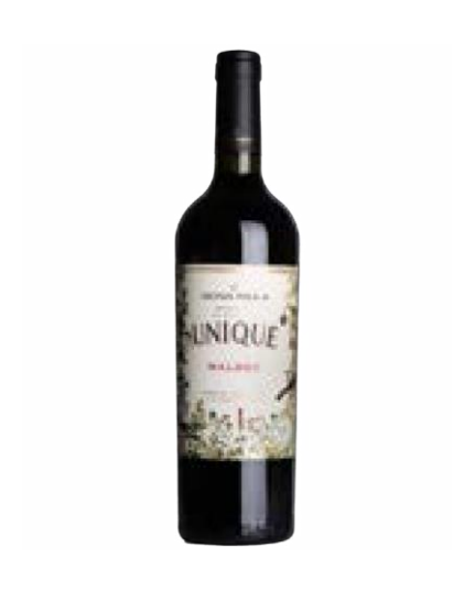
43 Malbec, Dona Paula Unique Organic